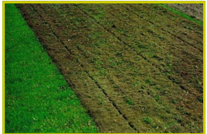
Results Before Leveling On Grassed Surface