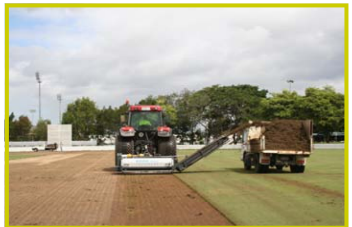
Koro FTM In Action