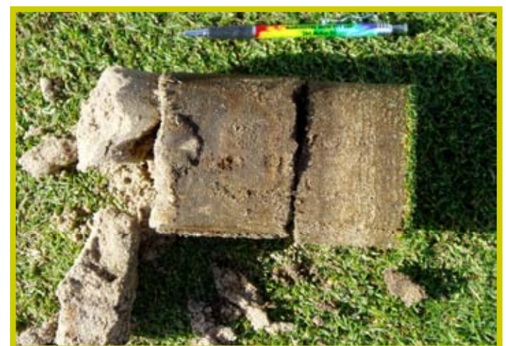
Regular Recycling Reduces Layering Issues