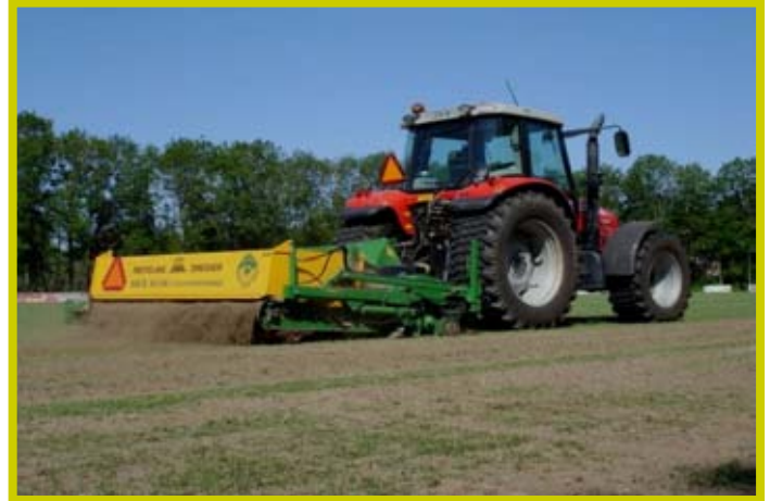
Koro Recycling Dresser In Action